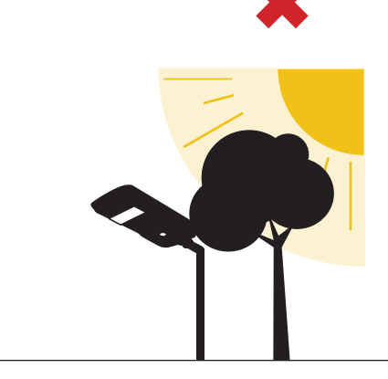
Limited or no direct sunlight, shaded by trees or blocked by buildings

Most hours of direct sunlight, unblocked by trees or buildings